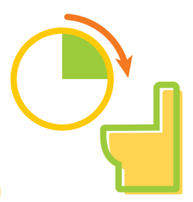
Frequent urination or pain when urinating