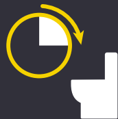
Frequent urination or pain when urinating 3,4