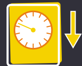
Weight loss 4