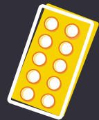
Repeated urinary tract infections 4