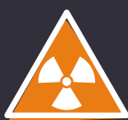
Past radiation exposure 3