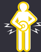
Abdominal, lower back & pelvic pain 3,4