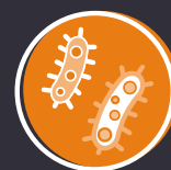
Parasitic infections 3

It is not always clear what causes bladder cancer, and some people can be diagnosed without having had exposure to any of the listed causes.